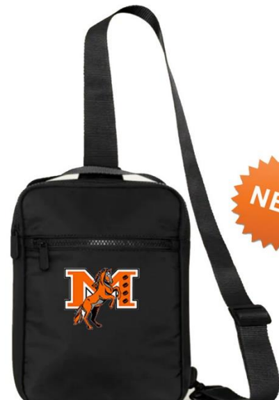
CROSSBODY BAG $16.00