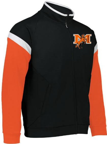
LIMITLESS JACKET (YOUTH) S-XL = 60.00