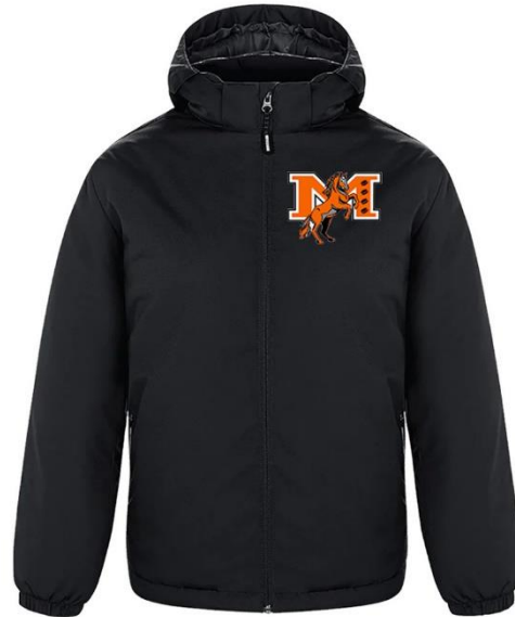
PLAYMAKER INSULATED JACKET (YOUTH) S-XL = 78.00