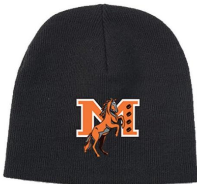
KNIT SKULL CAP 8.95