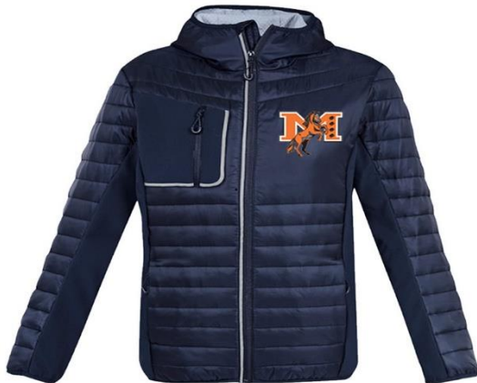
BIZ COLLECTION JACKET XXS-XL = 90.00 XXL-5XL = 95.00